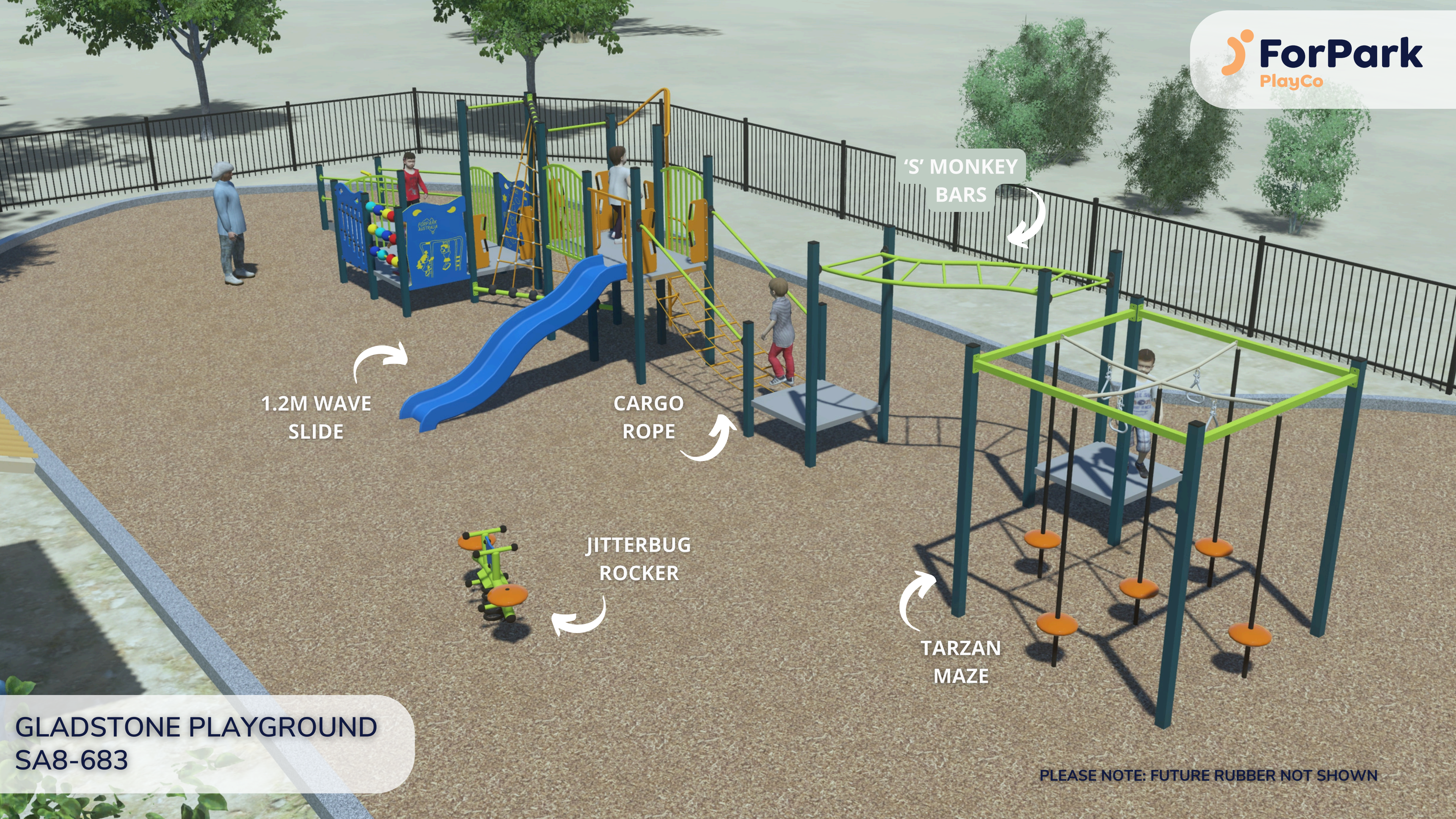
1.2M WAVE SLIDE