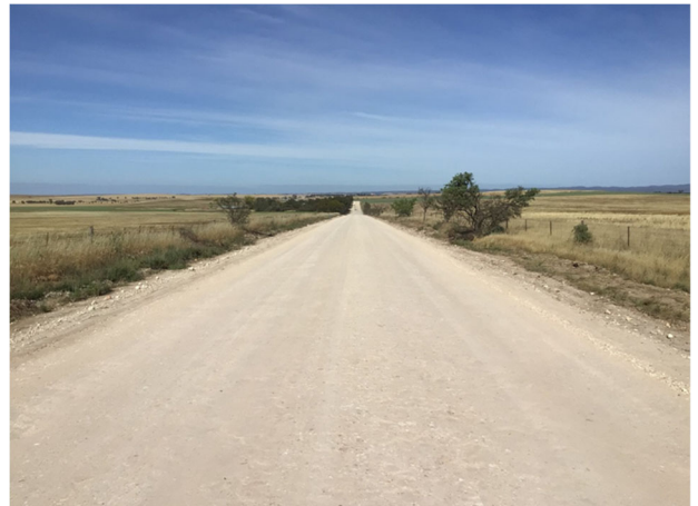
A freshly re-sheeted section of the Laura-Caltowie road