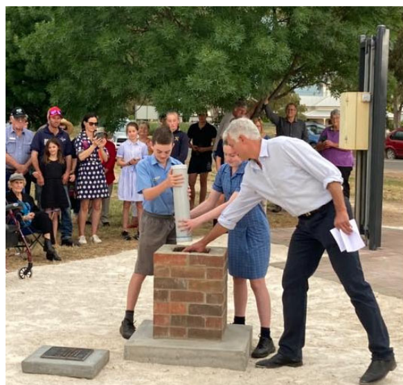
St James School students place their information in the time capsule at the town entry bay

The 300 page hard bound book comprises a collection of articles and stories of interest across the past 50 years.