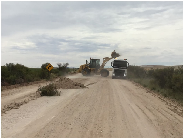
Verge clean up prior to re-sheeting on the Laura-Caltowie Road

Please remember to slow down around worksites and drive to the conditions of the unsealed roads. We have had some complaints about slipperiness of the finished surface after a road has been freshly re-sheeted and received its first rain. This is normal and is generally the sign of a good finished road, once it dries back and forms a crust it will be fine.